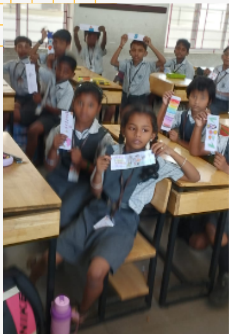
Making a Book Mark